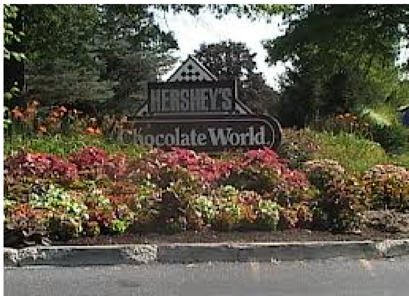
Hershey's Chocolate Company

Milton Hershey is remembered as someone who built an entire city and helped people get jobs. He is remembered for someone who made a school for children who did not have families. He is someone who made a medical center to help those who are sick and someone who made that chocolate, that yummy chocolate that most of us throughout the world enjoy.